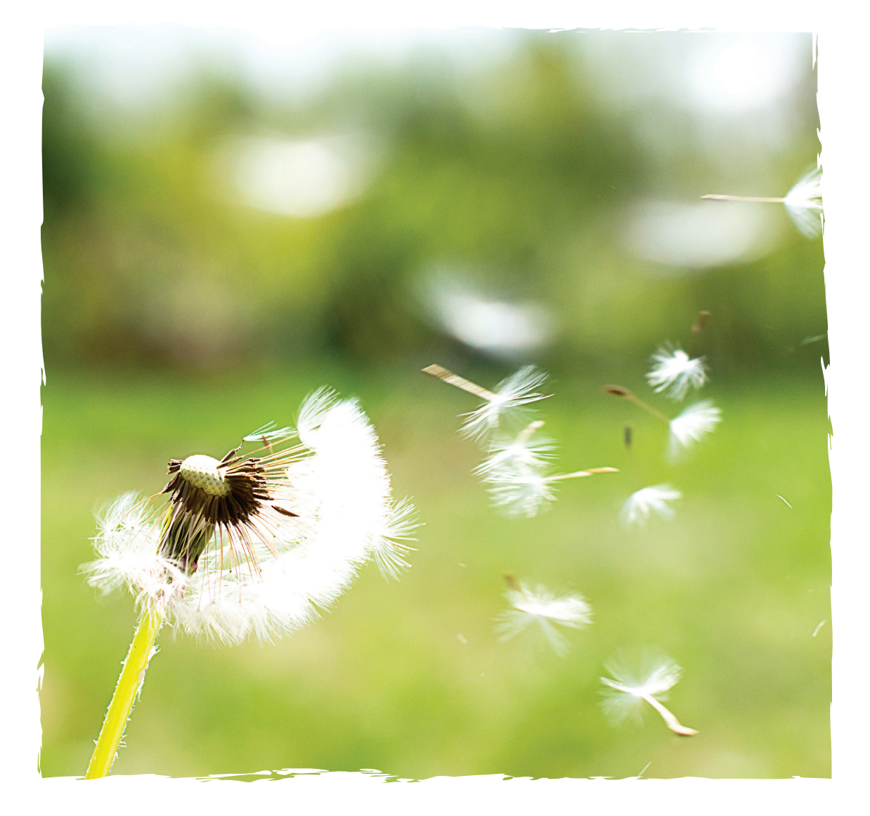
WIND: Low-carbon liquid fuels made from wind renewable energy are sustainable liquid fuels with no or very limited net CO_2 emissions during their production and use compared to fossil-based fuels.

To meet the 2050 climate-neutrality goal, we believe Europe and its consumers need a plan where lowcarbon liquid fuels and electrification/ hydrogen in road transport sit side by side.