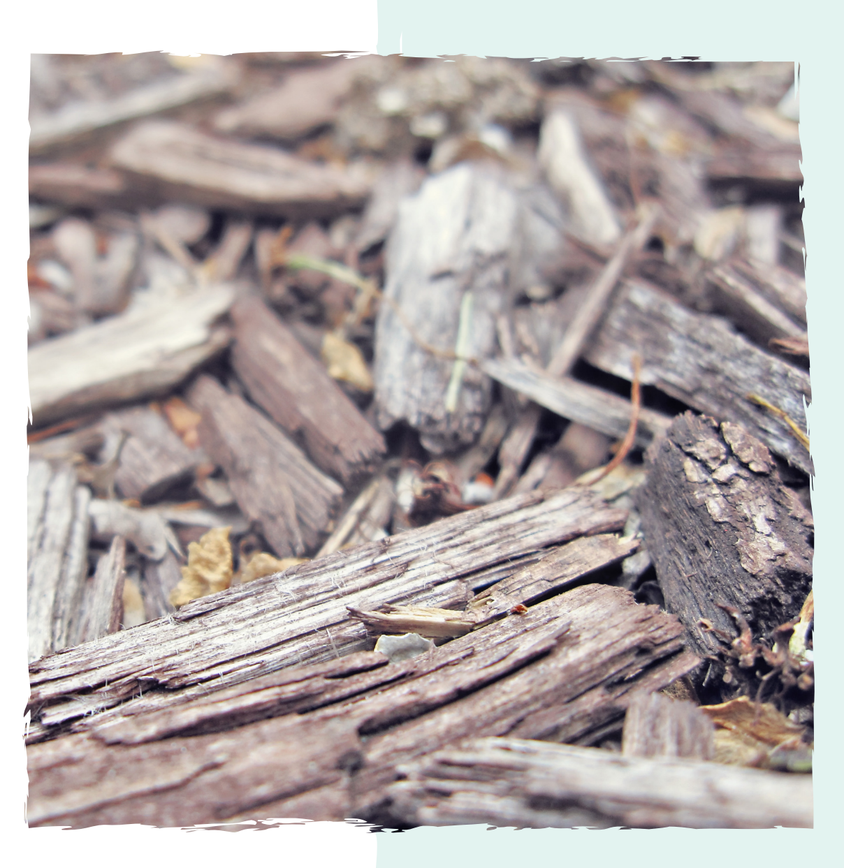
BIOMASS: Low-carbon liquid fuels made from biomass are sustainable liquid fuels with no or very limited net CO_2 emissions during their production and use compared to fossil-based fuels.

The EU refining industry stands ready to step up collaboration with other industries and with EU policymakers, to take bold climate action together. In order to deliver climate neutral transport by 2050, we urge EU policymakers to establish a high-level dialogue in 2020 with all concerned stakeholders to create the necessary policy framework. The following key policy principles are central to delivering our 2050 climate – neutral ambition and should serve as a starting point for discussion: