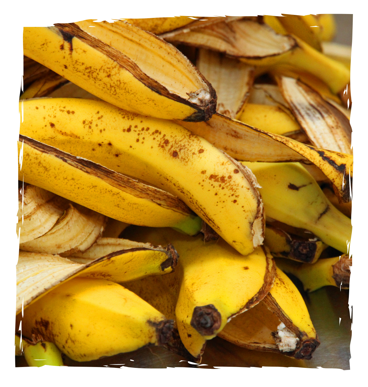
WASTE: Low-carbon liquid fuels made from waste are sustainable liquid fuels with no or very limited net CO_2 emissions during their production and use compared to fossil-based fuels.