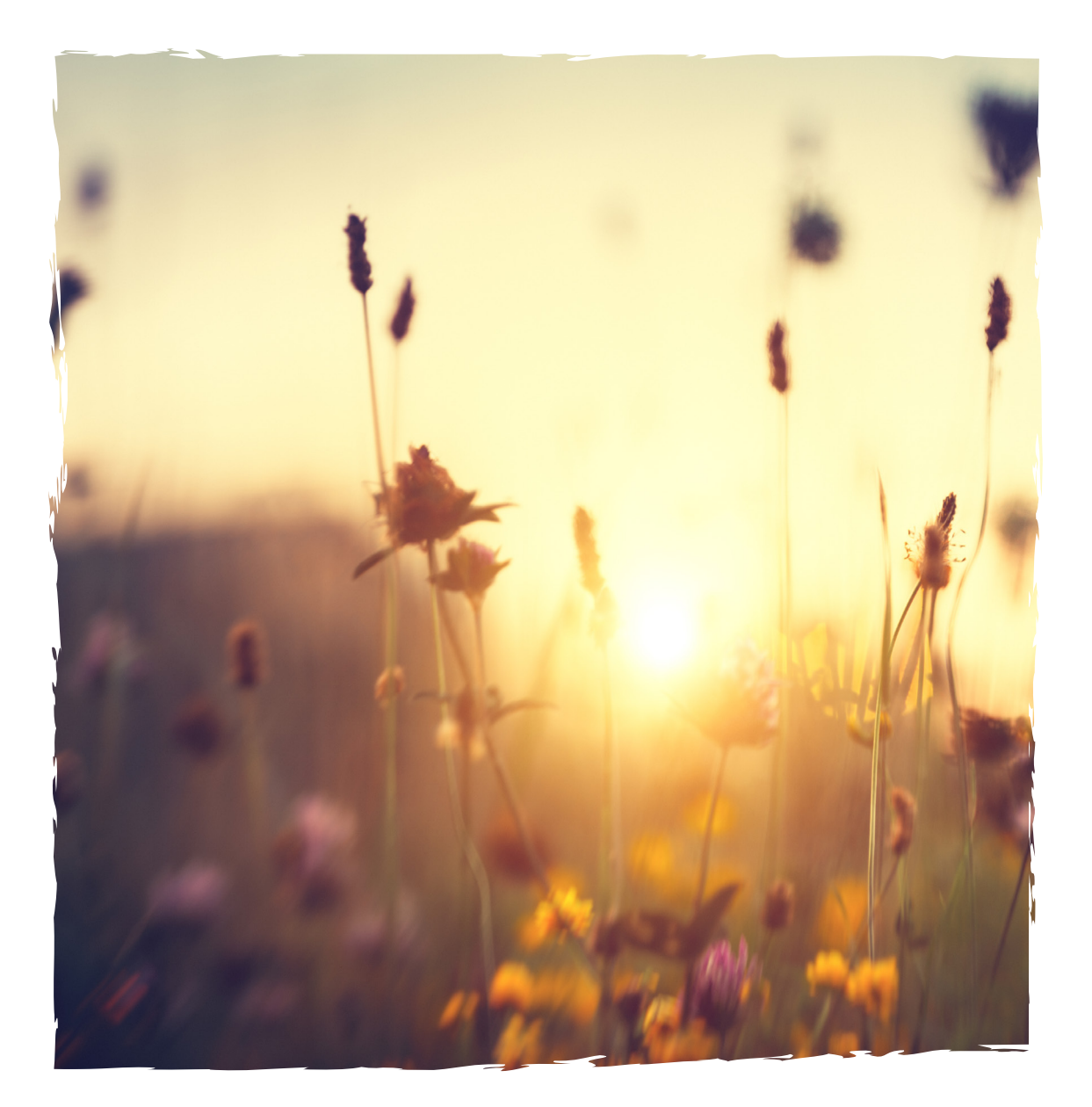
SOLAR: Low-carbon liquid fuels made from solar renewable energy are sustainable liquid fuels with no or very limited net CO_2 emissions during their production and use compared to fossil-based fuels.

The ambition of the European Union is to be climate neutral by 2050. The European refining industry supports the same ambition.